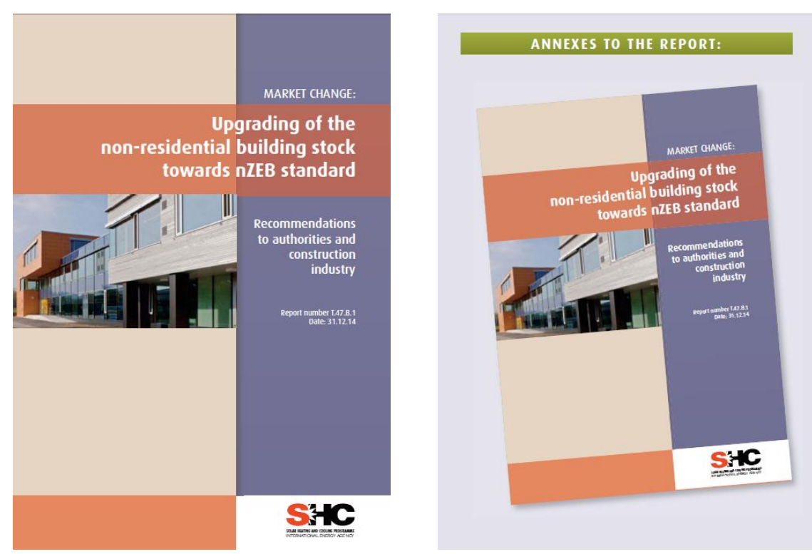
Figure 2. Subtask B report and accompanying Annexes for the report.

The main findings of Subtask B can be summarized in two different sets of recommendations; Recommendation to authorities and recommendations to the building industry: